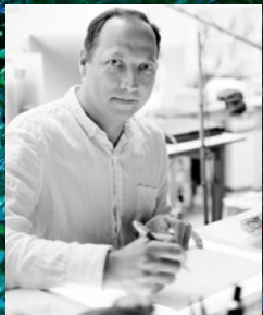
MCL37L LARGE IVY SHADOW CHANDELIER