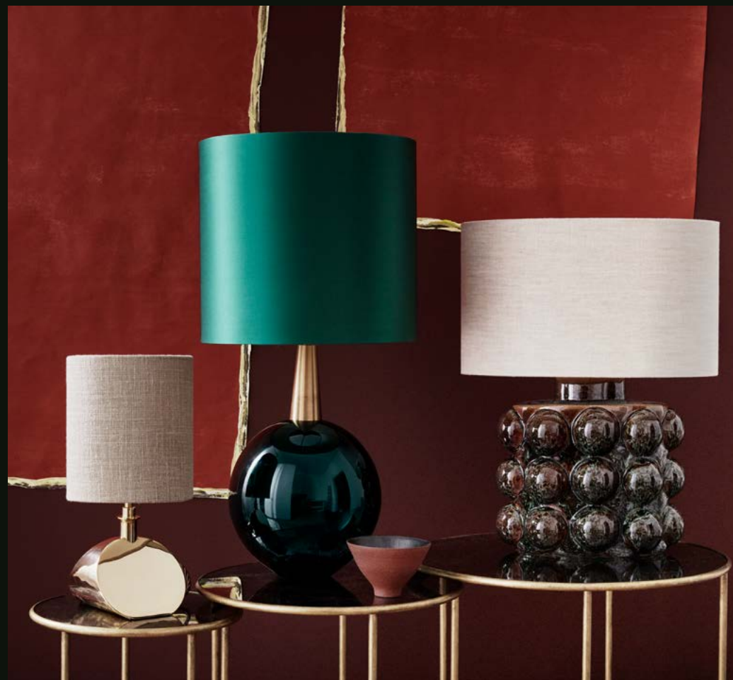
SWAY LAMP Polished Brass 7" Top Hat Husk linen shade