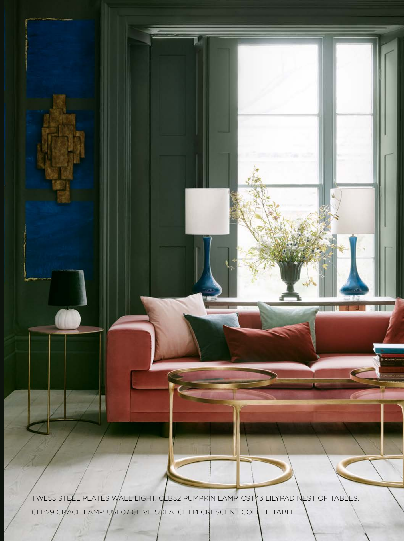
TWL53 STEEL PLATES WALL LIGHT, CLB32 PUMPKIN LAMP, CST43 LILYPAD NEST OF TABLES, CLB29 GRACE LAMP, USF07 CLIVE SOFA, CFT14 CRESCENT COFFEE TABLE