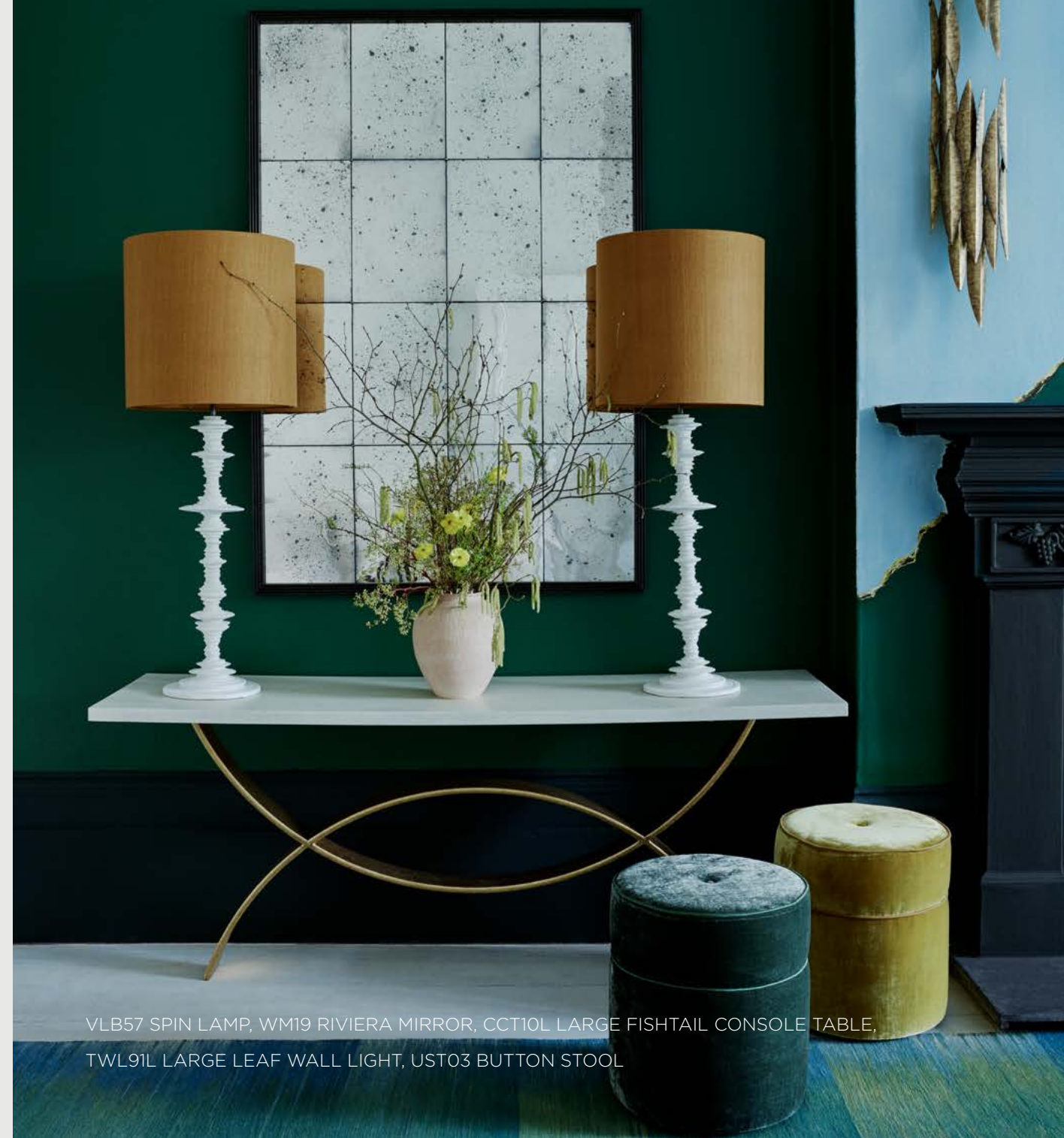
VLB57 SPIN LAMP, WM19 RIVIERA MIRROR, CCT10L LARGE FISHTAIL CONSOLE TABLE, TWL91L LARGE LEAF WALL LIGHT, UST03 BUTTON STOOL

Our Design Team, led by Shazeen Emambux have a dynamic approach to design, they collaborate with our makers and painting studio to bring our creations to life.