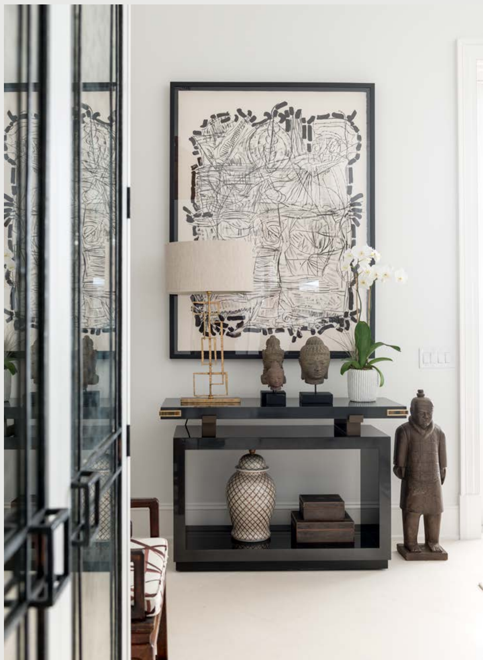
LARGE SALPERTON LAMP Decayed Gold 20" Straight Oval Natural linen shade

DESIGNER: LES ENSEMBLIERS